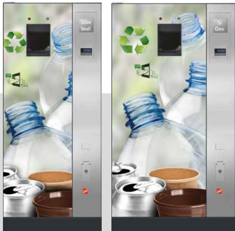
Sielaff's SiOne series comprises the SiOne Small and SiOne.